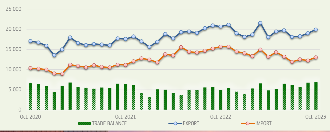
EU27: Trade of agri-food products (million EUR)

EU imports increased by 6% month-on-month in October. They reached EUR 13 billion, still 17% below their level of October 2022. Cumulative imports (from January to October 2023) reached EUR 132.8 billion, 6% below their 2022 level, with increases in tobacco products and sugar imports and reductions in imports of oilseeds and protein crops as well as vegetable oils.