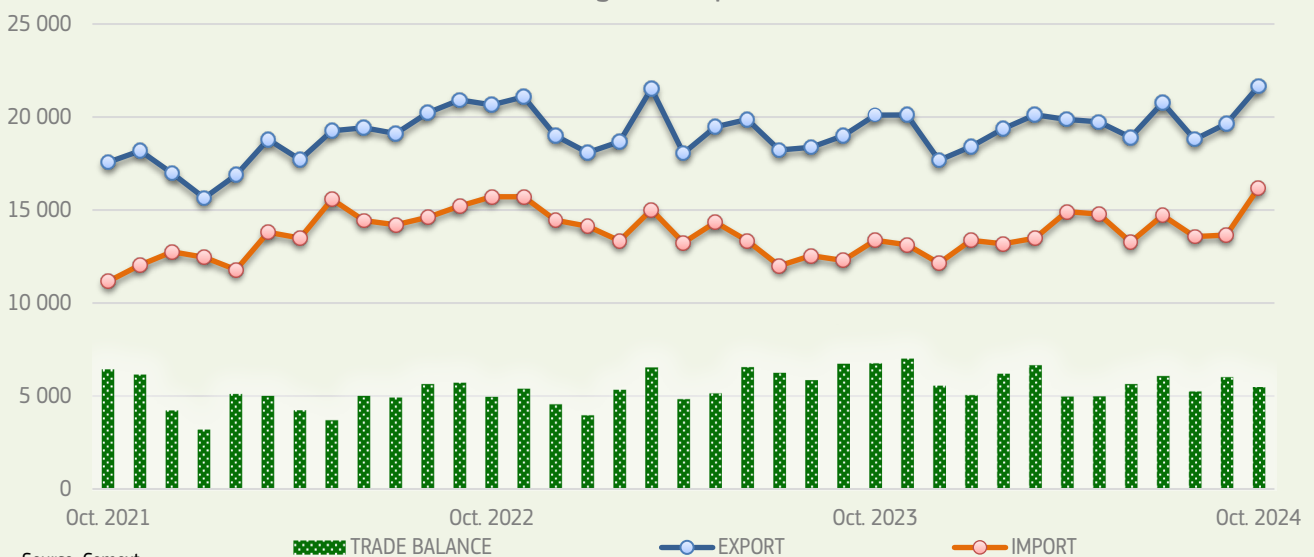
EU27: Trade of agri-food products (million EUR)

EU imports increased by 19% month-on-month in October and also reached a record level at EUR 16.2 billion, 21% higher compared to October 2023. This is explained by increased import volumes, as well as increased import prices, approaching their 2022 level again. Cumulative imports between January and October reached EUR 141.1 billion, 6% higher compared to 2023. Imports from Côte d'Ivoire had the largest increase in value, while those from Australia had the largest reduction.