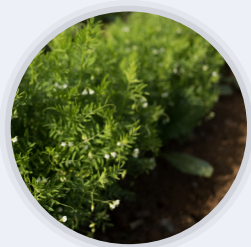
Planting of nitrogen-fixing crops like leguminous crops