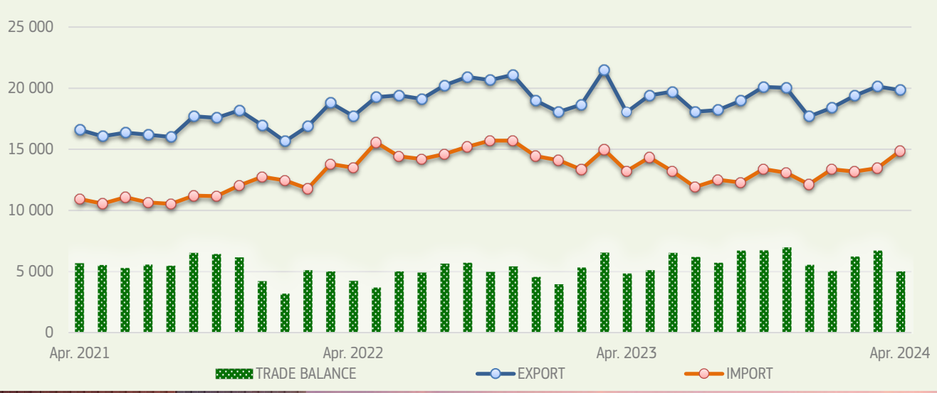
EU27: Trade of agri-food products (million EUR)

EU imports increased by 10% month-on-month in April 2024 and reached EUR 14.8 billion, 12% higher than in April 2023. Imports of cocoa products, fruit and nuts and olives and olive oil increased, while those of oilseeds and cereals decreased. EU imports are mainly concentrated on a few product categories which represent 43% of EU imports: Coffee, tea, cocoa and spices, Fruit and nuts and Oilseeds and protein crops.