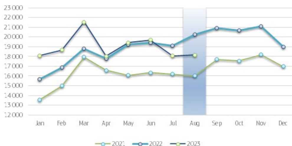
EU exports of agri-food products to extra-EU (million EUR)

Reductions in exported volumes are also significant for sugar and isoglucose (-30%), olives and olive oil (-24%), pet food and forage crops (-20%), as well as vegetables (-15%). However, they are compensated by higher export prices.