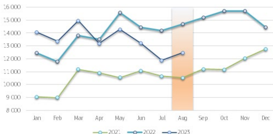
EU imports of agri-food products from extra-EU (million EUR)

Import values decreased for oilseeds and protein crops compared to 2022 (-EUR 2 billion, -12%), as well as for vegetable oils (-1.9 billion, -27%), and non-edible products for technical use (-EUR 1 billion, -14%). These reductions are mostly explained by reduced import prices.