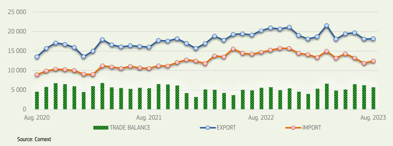
EU27: trade of agri-food products (million EUR)

EU imports increased by 5% month-on-month to reach EUR 12.5 billion. However, they remain 15% below their level in August 2022. Cumulative imports (from January to August 2023) reached EUR 107.4 billion, 3% below their 2022 level, with reductions in imports of oilseeds and protein crops as well as vegetable oils.