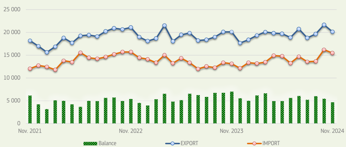
EU27: Trade of agri-food products (million EUR)

EU imports decreased by 5% month-on-month in November and reached EUR 15.5 billion, still 18% higher than in November 2023. This is explained by high import prices, in particular for cocoa and coffee, as well as increased import volumes. Cumulative EU imports between January and November reached EUR 156.6 billion, 7% higher compared to 2023. Imports from Côte d'Ivoire had the largest increase in value, while those from Russia had the largest reduction.