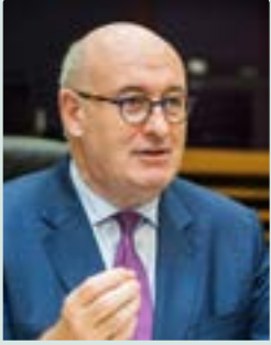
Phil Hogan, European Commissioner for Agriculture and Rural Development

Phil Hogan grew up on a farm in rural Kilkenny, in southeast Ireland. From 1989 until he became Commissioner in November 2014, he represented the Carlow/Kilkenny constituency in Dail Eireann, the Irish Parliament, where he served in the Fine Gael Party shadow cabinet and as spokesman on Europe, on the food industry, on consumer affairs and on regional policy. Between 2011 and 2014, he served as Minister for the Environment and Local Government in the Irish Government of Prime Minister Enda Kenny TD. During this time, he successfully implemented a broad-ranging agenda, including the biggest reform of local government since the foundation of the Irish State. Prior to his entry to politics, he established and subsequently directed an insurance and real estate business. He also managed the family farm between 1981–83 and is a graduate of University College Cork, with a BA in Economics and Geography (1981).