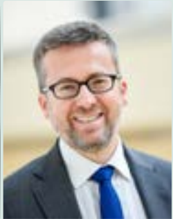
Carlos Moedas, European Commissioner for Research, Science and Innovation

Carlos Moedas was born in Beja (Portugal) in 1970. He graduated in Civil Engineering from the Higher Technical Institute (IST) in 1993 and completed the final year of studies at the École Nationale des Ponts et Chaussées in Paris (France). He worked in engineering for the Suez-Lyonnaise des Eaux group in France until 1998.