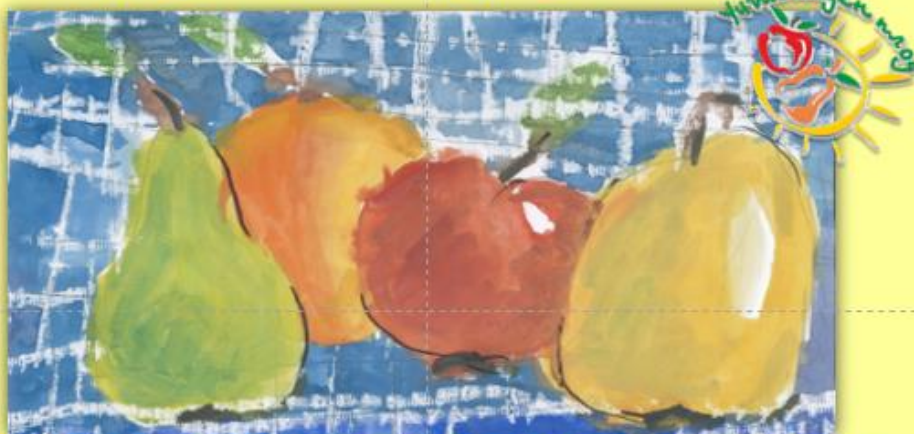
СХЕМА НА ЕВРОПЕЙСКИЯ СЪЮЗ ЗА ПРЕДЛАГАНЕ НА ПЛОДОВЕ И ЗЕЛЕНЧУЦИ В УЧИЛИЩАТА

НАШЕТО УЧЕБНО ЗАВЕДЕНИЕ УЧАСТВА В ЕВРОПЕЙСКА СХЕМА ЗА ПРЕДЛАГАНЕ НА ПЛОДОВЕ И ЗЕЛЕНЧУЦИ В УЧИЛИЩАТА С ФИНАНСОВАТА ПОДКРЕПТА НА ЕВРОПЕЙСКИЯ СЪЮЗ