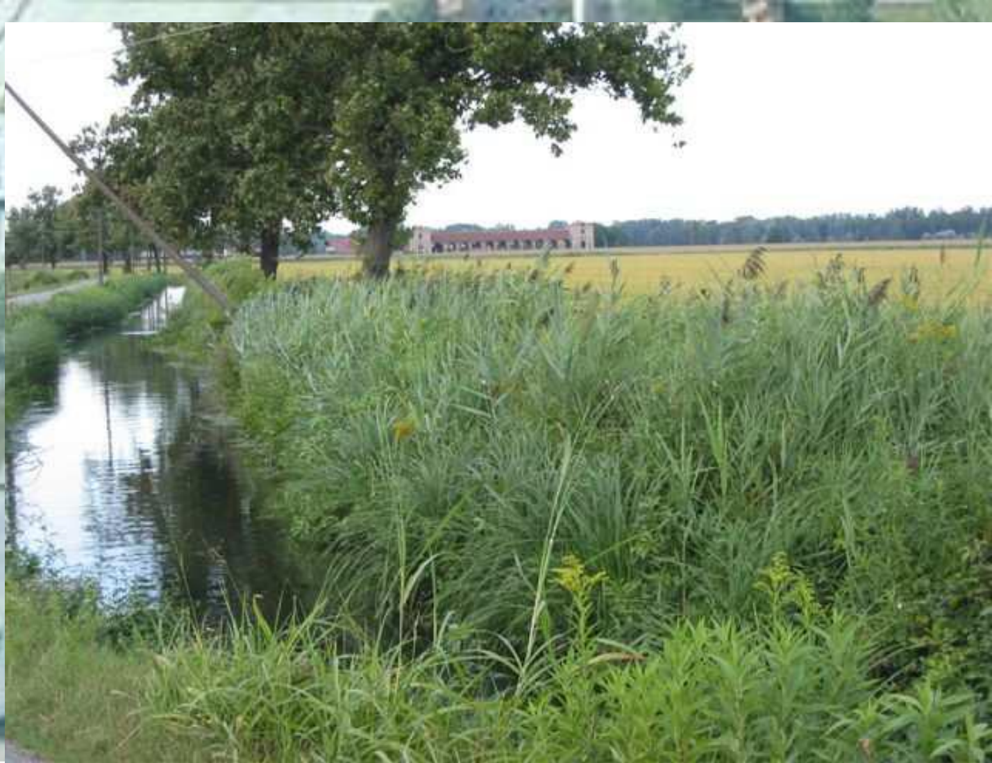
5. Landscape enhancement: hedges, rows, wooded buffer strips