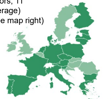
■ Response received ■ No response received