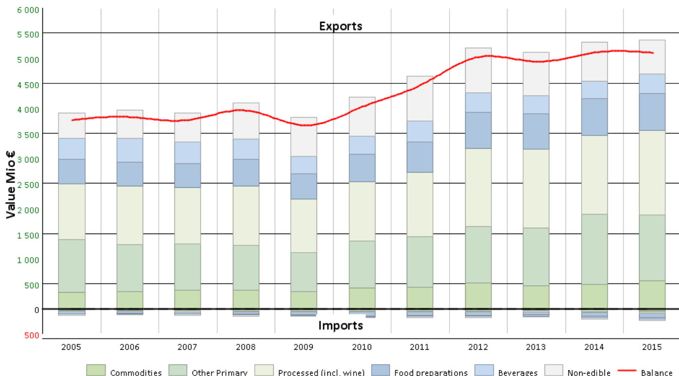
Structure of EU Agri-food trade with Japan, 2005 - 2015

The most important Japanese export products to the EU market are soups and sauces, spirits and liqueurs, food preparations and seeds.