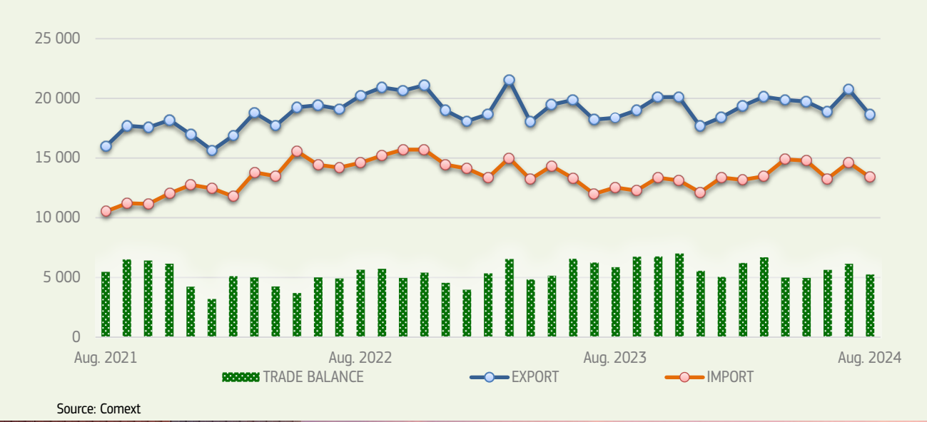
EU27: Trade of agri-food products (million EUR)

EU imports decreased by 8% month-on-month in August and reached EUR 13.4 billion. However, they remain 7% higher compared to August 2023. Cumulative imports between January and August reached EUR 111 billion, 3% higher compared to 2023. Import values for cocoa products increased compared to 2023 due to higher prices, while those of oilseeds and cereals decreased. Imports from Côte d'Ivoire had the largest increase in value, while those from Australia had the largest reduction.