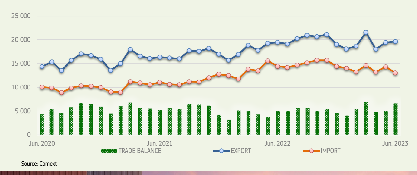
EU27: Trade of agri-food products (million EUR)

EU imports decreased in June to EUR 13 billion, a 9% reduction month-on-month. They were 10% below their level in June 2022. Cumulative imports on the first half of 2023 remain 1% higher compared to the same period in 2022, notably with higher cereals imports but lower vegetable oil and oilseeds imports.