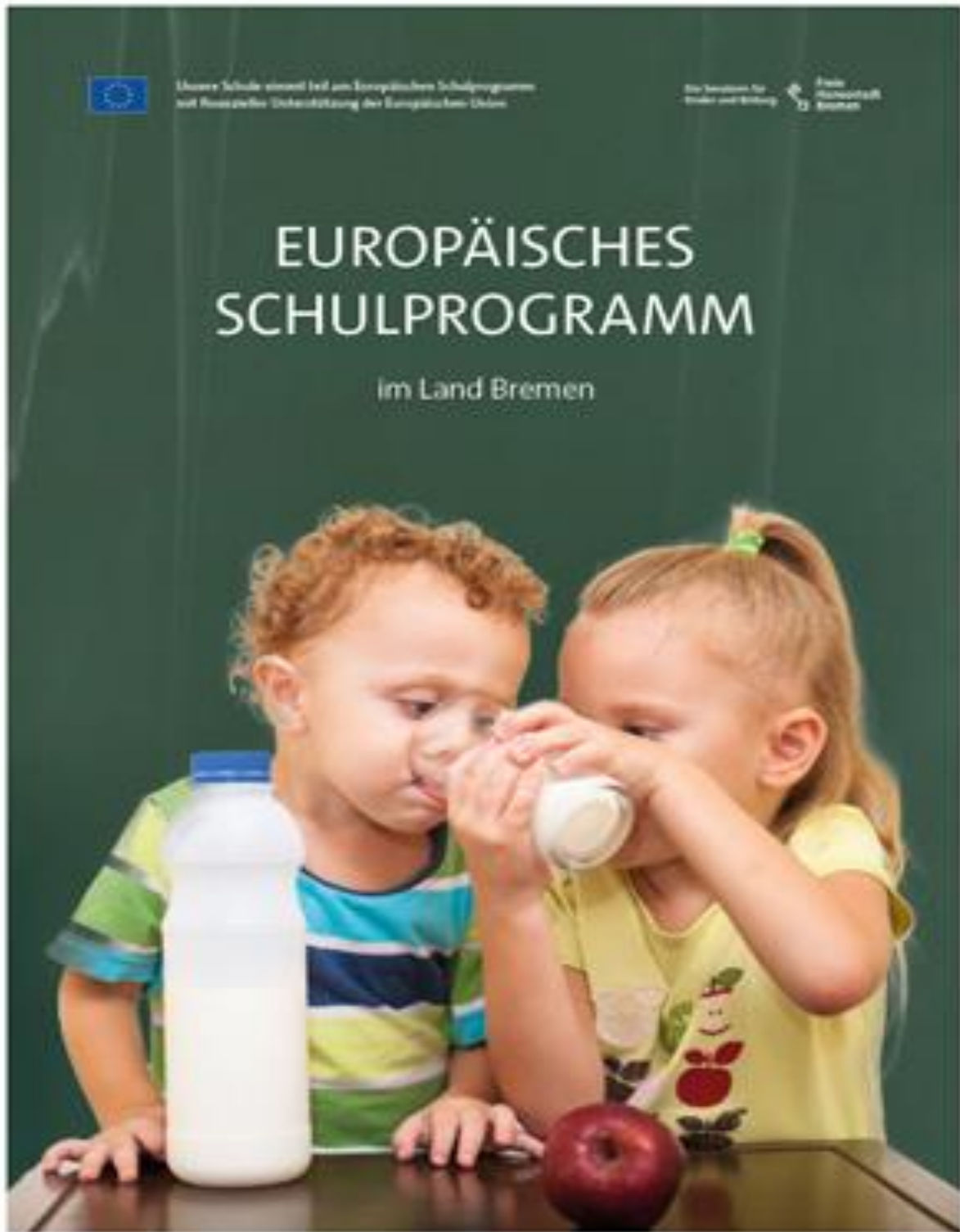
Annex: EU school scheme poster