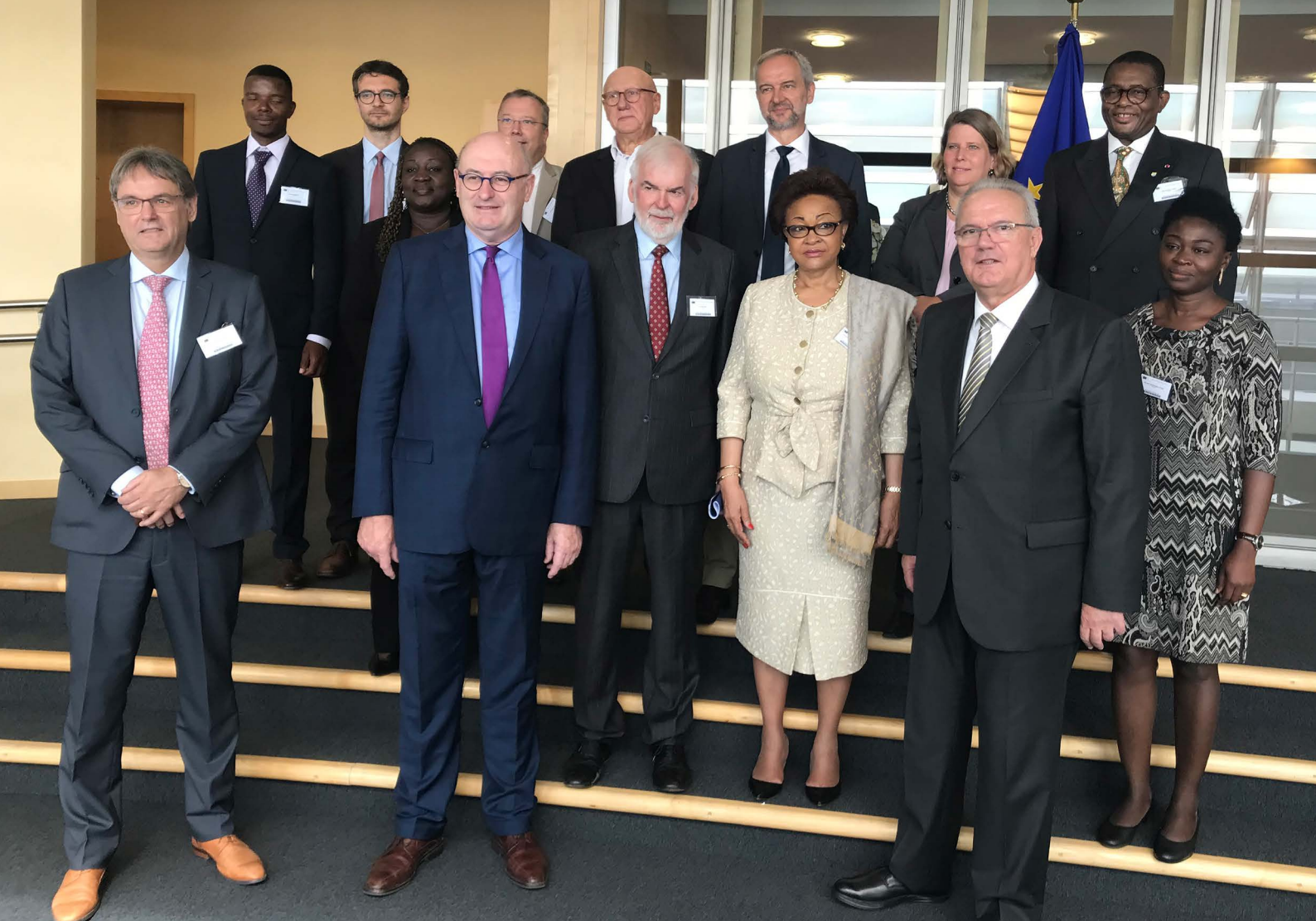
First meeting of the Task Force Rural Africa on 24th May 2018 with Commissioners Josefa Leonel Correia Sacko, Neven Mimica and Phil Hogan