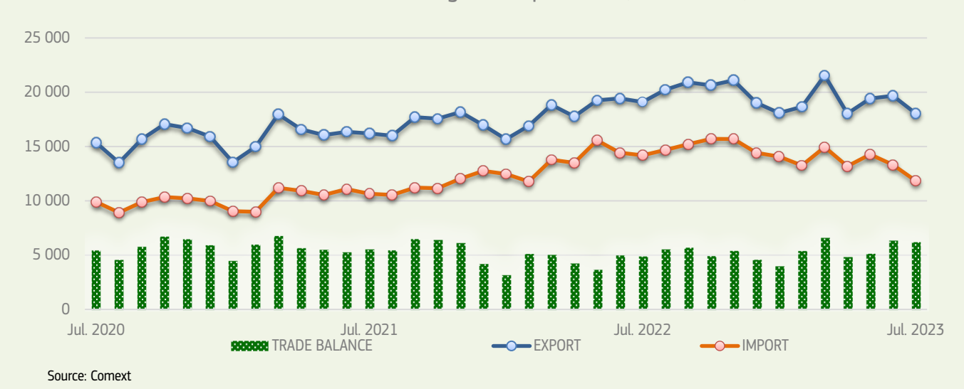
EU27: Trade of Agri-food products (million EUR)

EU imports continued to decrease in July to EUR 11.8 billion, a 11% reduction month-on-month and 17% below their 2022 level. Cumulative imports (from January to July 2023) reached EUR 94.9 billion, at a similar level than in 2022, with increases in imports of cereals and reductions in imports of oilseeds and protein crops as well as vegetable oils.