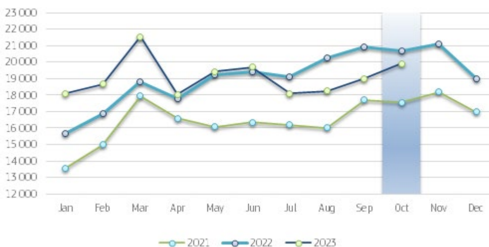
EU exports of agri-food products to extra-EU (million EUR)

Exports of pigmeat remain at a low level, with a reduction of EUR 1.2 billion (-10% in value, -19% in volume). Cumulated exports of spirits and liqueurs decreased by EUR 693 million (-8%), and wine and wine-based products by EUR 520 million (-3%), due to reduced volumes exported.