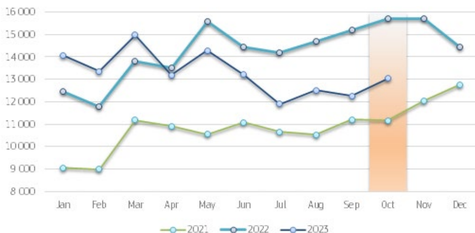
EU imports of agri-food products from extra-EU (million EUR)

On the other hand, significant reductions in import value could be observed for oilseeds and protein crops (-EUR 3.4 billion, -16%) and vegetable oils (-EUR 2.8 billion, -30%), due to reductions of both prices and volumes. Similar reductions in import values were observed for non-edible products (-EUR 1.6 billion, -17%, mostly due to lower prices), coffee, tea, cocoa and spices (-EUR 1.3 billion, -7%) and margarine and other oils and fats (-EUR 1.1 billion, -24%).