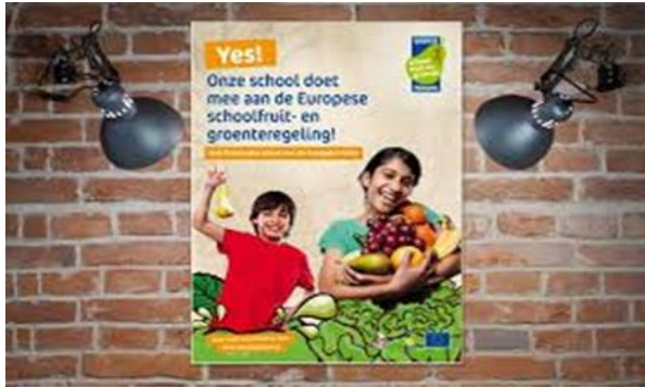
Annex. School scheme poster