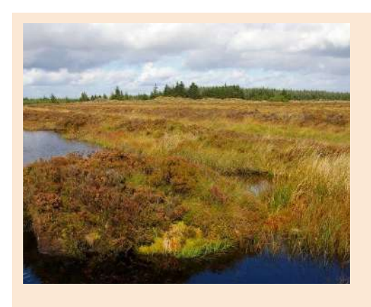
Peatland Restoration and/or Rewetting